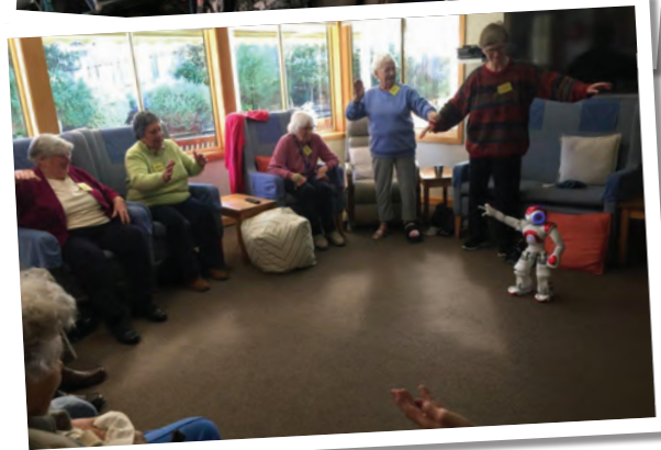
Manor Gardens visitors enjoy getting creative with their hats every Thursday and joining in on some exercise with Elroy, our dementia robot.