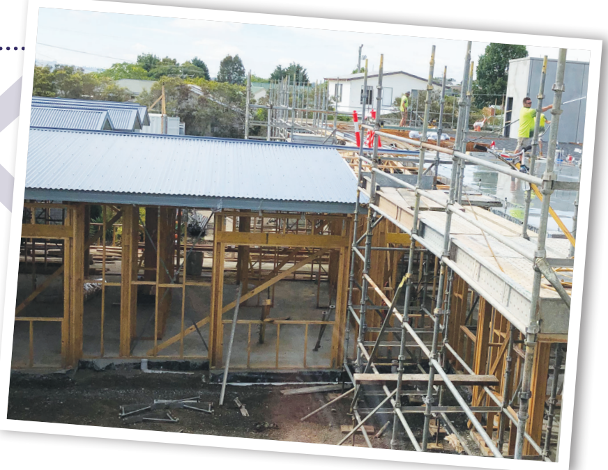
Photo shoot fun

Portion 4 of Peace Haven is taking amazing shape! As we write this, the first-floor slab is being poured ready for timber wall frames, and the roof will be going on soon!